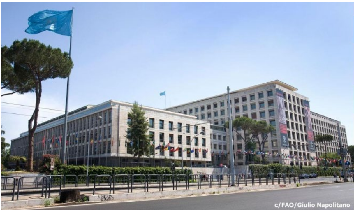
Picture of the FAO building

FAO headquarters is centrally located in Rome, near the Circo Massimo metro station and within walking distance of the Colosseum. The easily recognizable white building is also accessible from Ostiense train station, which is about a 15–20-minute walk away.